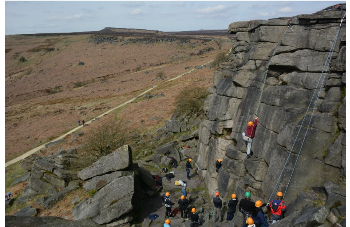
Burbage Rocks, Peak District