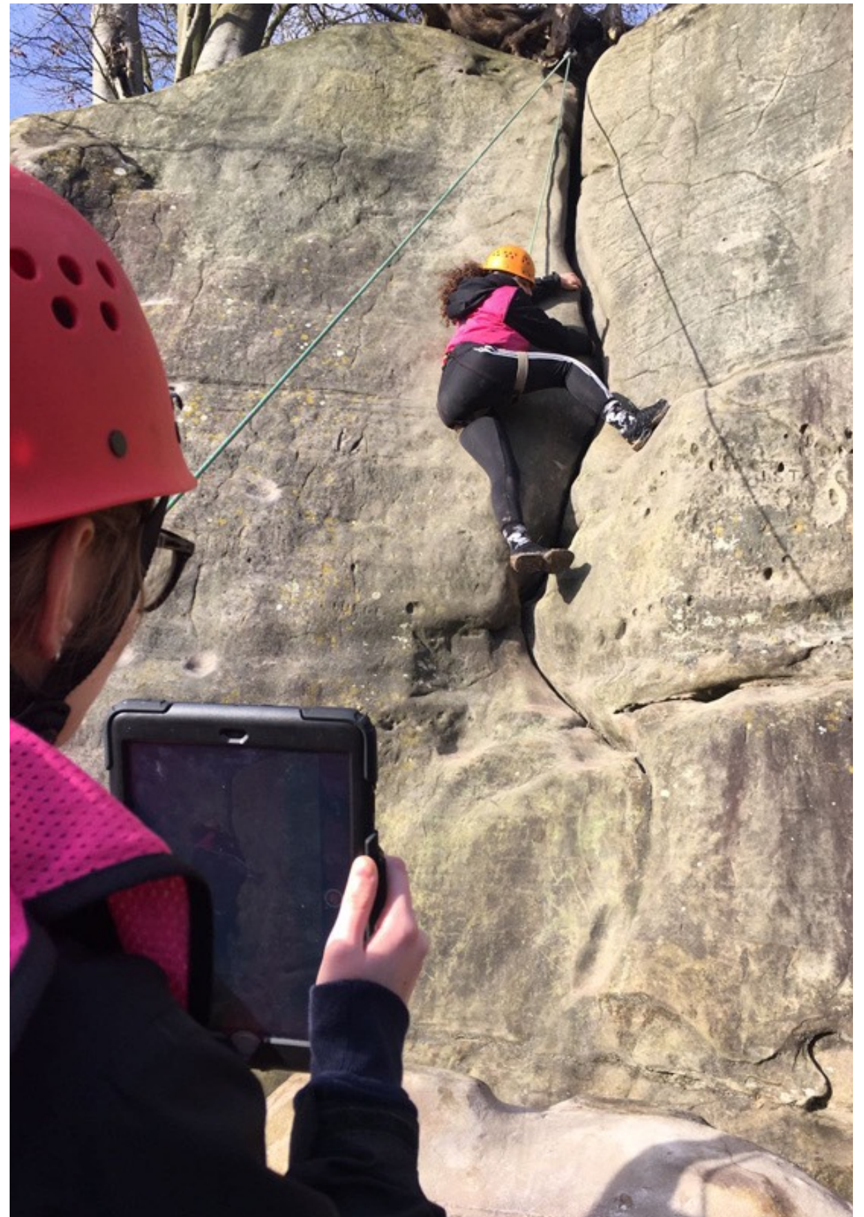
Stone Farm Rocks, Sussex