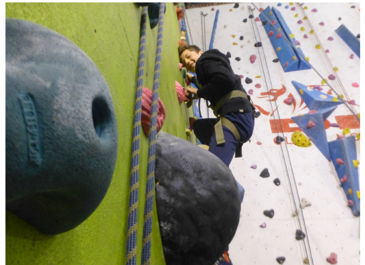
The Foundry Climbing Wall, Sheffield